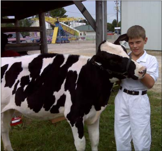
Students spent a morning of fun at the Seaforth Fall Fair on Fri. Sept. 11/09